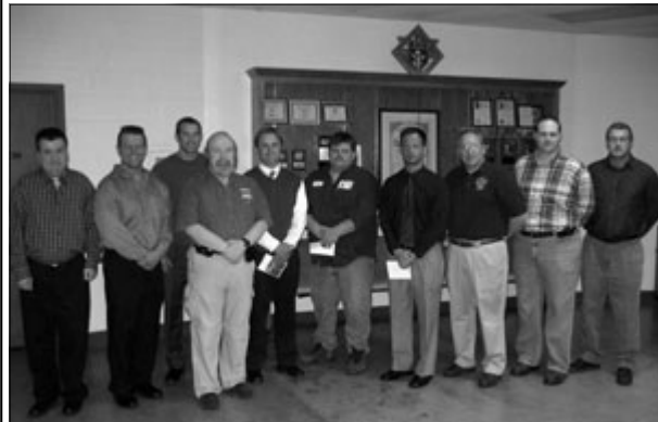
March New Members